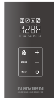
INCLUDED Illuminated Front Panel with Advanced Hydronic Operation