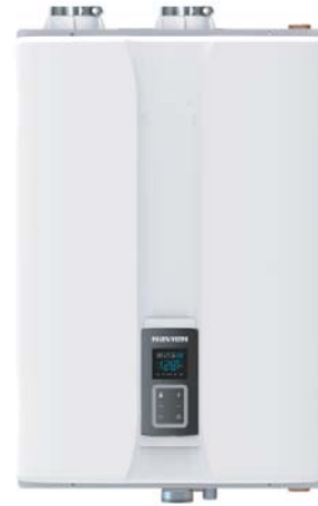
Sleek Design - Compatible with 2" PVC Vent